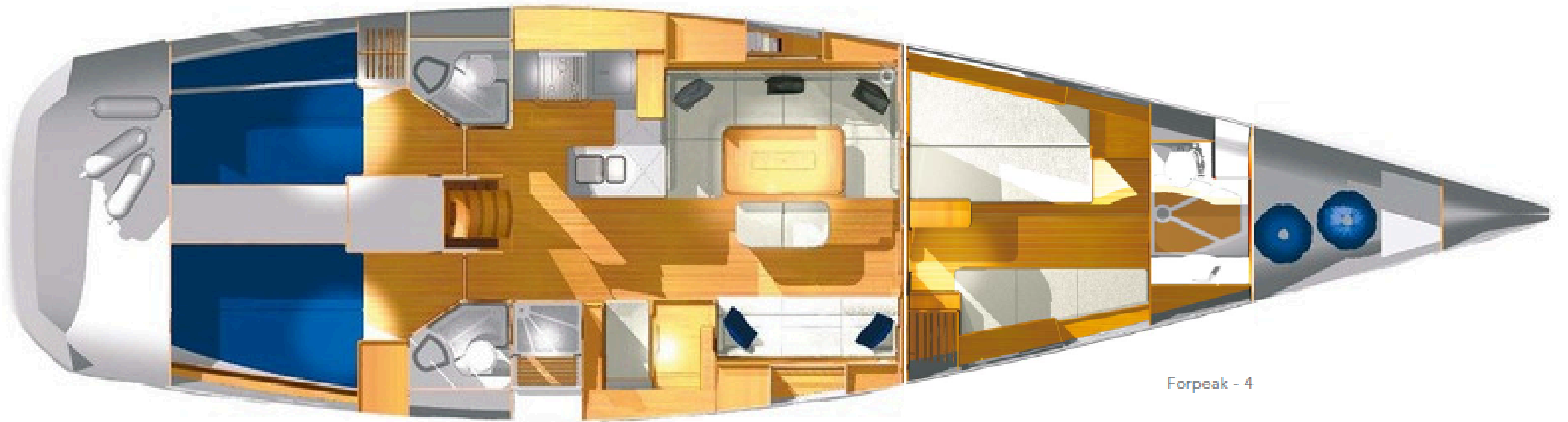
Forpeak - 4