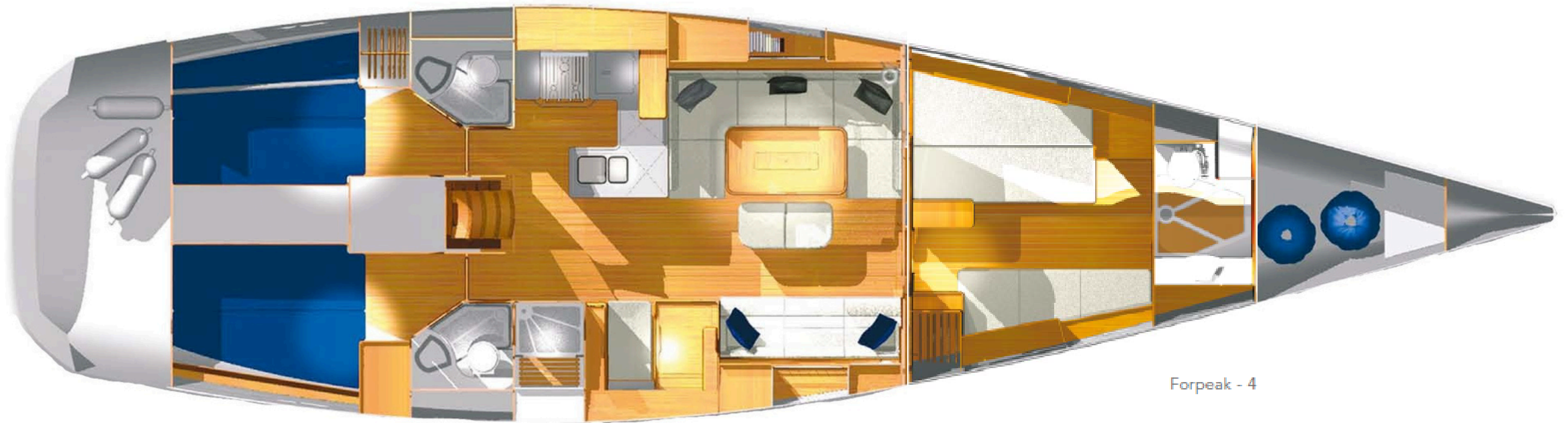
Forpeak - 4